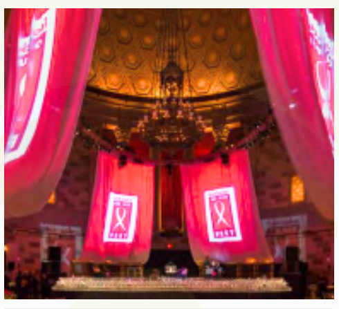
Your Branding Displayed on Broadway in NYC