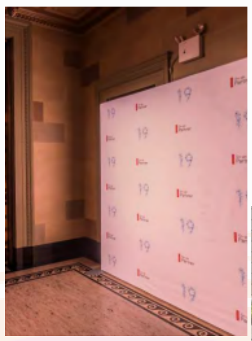
Make a statement the moment they walk through the door